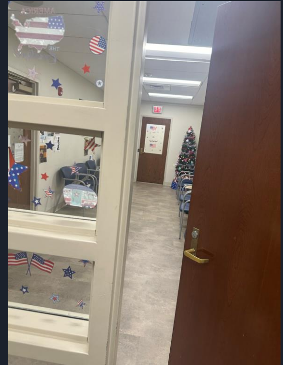
Inside of main lobby