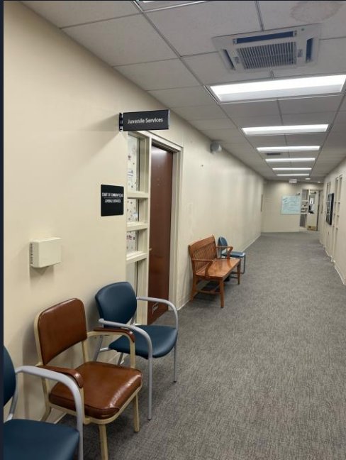
Hall outside the main office