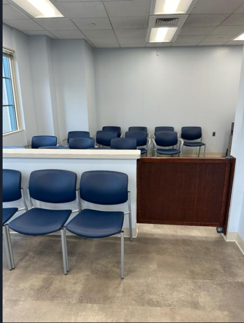
Where families sit. I also sat in this area.

This is the courtroom that is used exclusively for Juveniles.