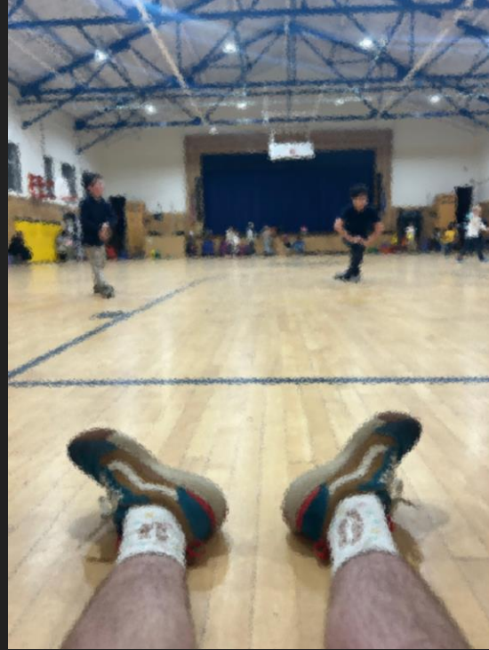
Sitting down in the gym taking a break after playing a couple rounds of basketball with the kids.