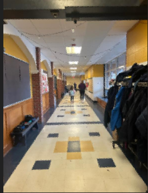
A cool shot of a teacher and kid walking down the hallways that connects the gym and wing hall.