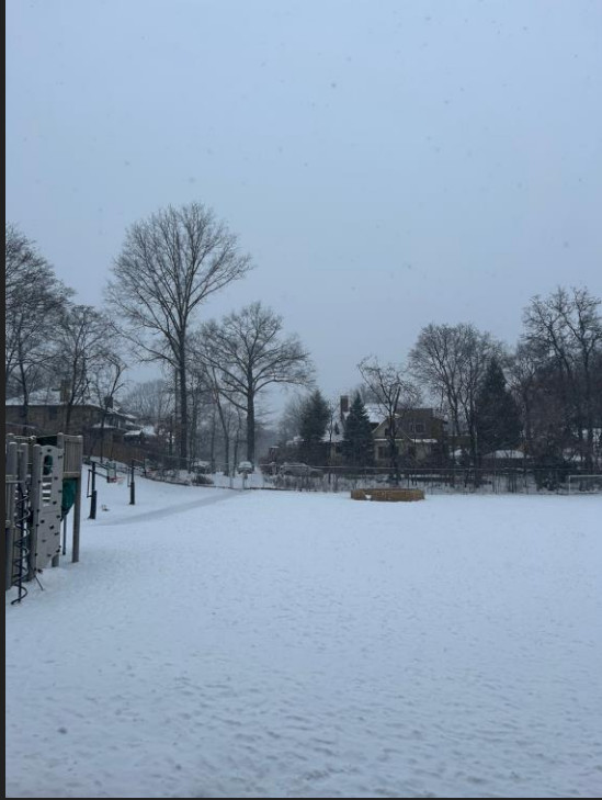
A super cold and snowy day in January and not many kids want to be outside too long in the temperatures we were having.