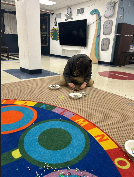
The dreaded day of perler beads.