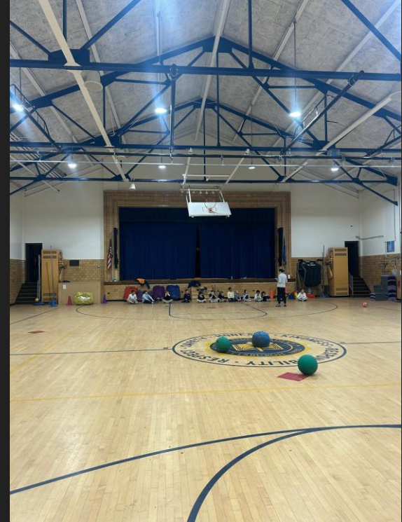
This is a picture of one of the enrichment classes that they are able to participate in. This particular one is right before they are about to begin the fencing class and this was just one of the many classes that they were able to take.