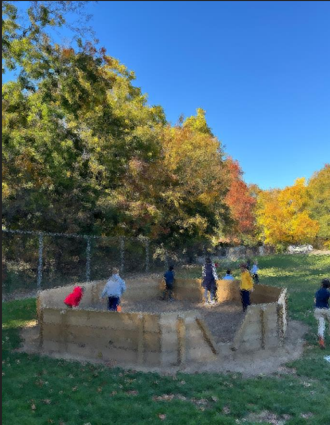
A nice and probably not problematic game of GaGa Ball. Watching them play this game when it was still warm out was always fun.