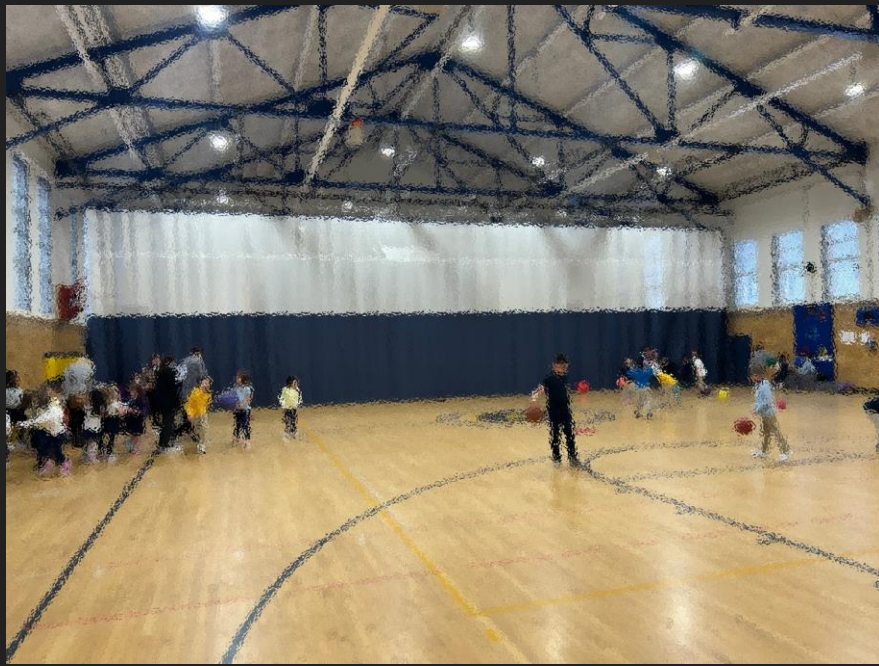
A picture of kids playing in the gym while I was supervising them on the last day I was going to be at Shady side.