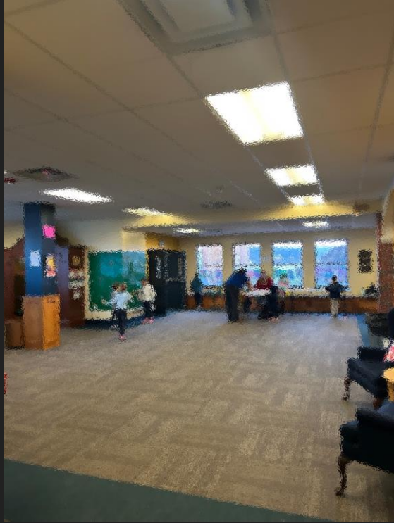
Kids playing on the Lego wall while two of my coworkers help out with a craft for some other kids in wing hall.