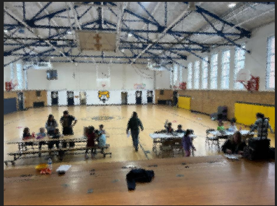
This was a picture of the one inservice day that I got to be apart of for a nice 8 hour shift. We got to do each shift in rotation and have a nice lunch in the middle which is shown here.