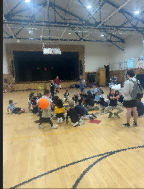
All the kids meeting in the circle where they learn all the places they can go for the day.