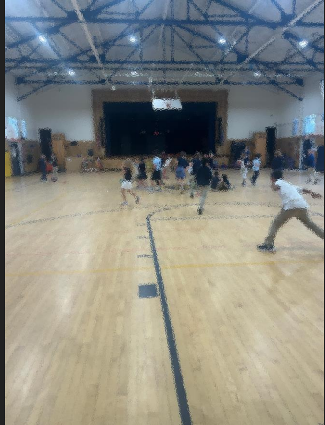
This is a picture of the kids playing in the gym on one of my first days. I stood in the back trying to get to know some of their names.