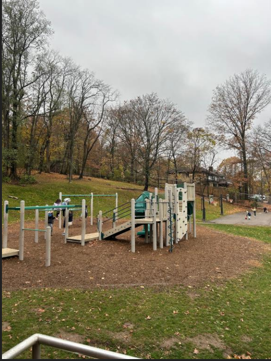
A shot of the playground while a couple kids played on the basketball court.