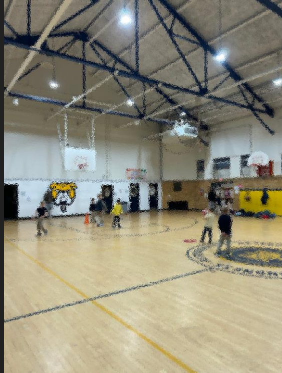
A game of kickball that my one coworker and I got to join in on in the gym.