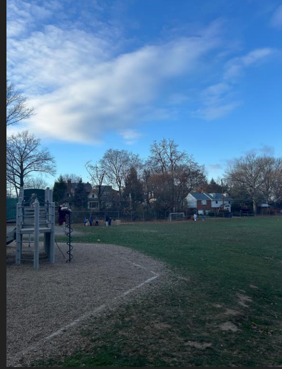
The sun starting to set as some kids still play on the playground and in the Gaga ball court.