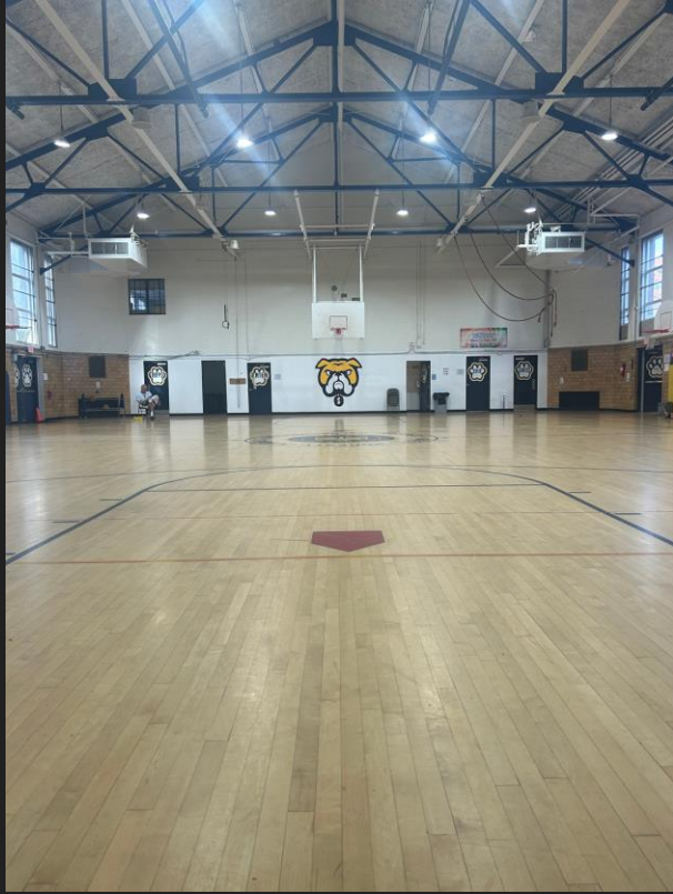
A cool shot of the gym with the shady side bulldog logo in the middle. This was right before the chaos of all the kids running through those doors on the right began