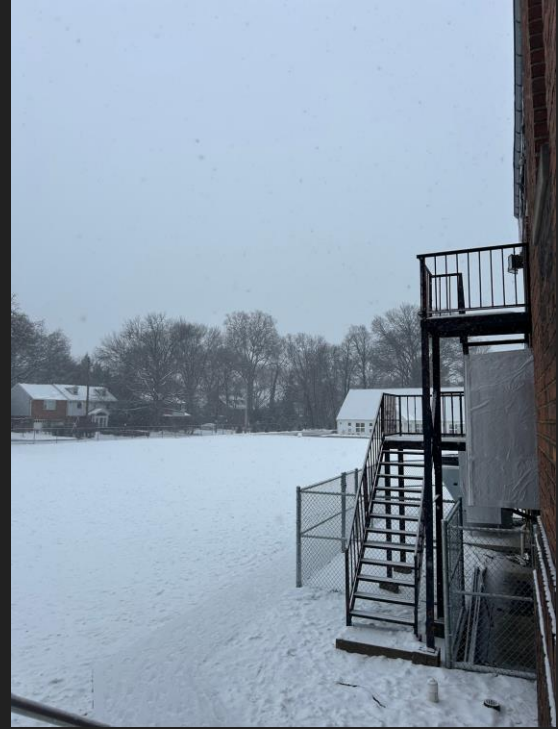
A different angle of the super snowy and cold day.